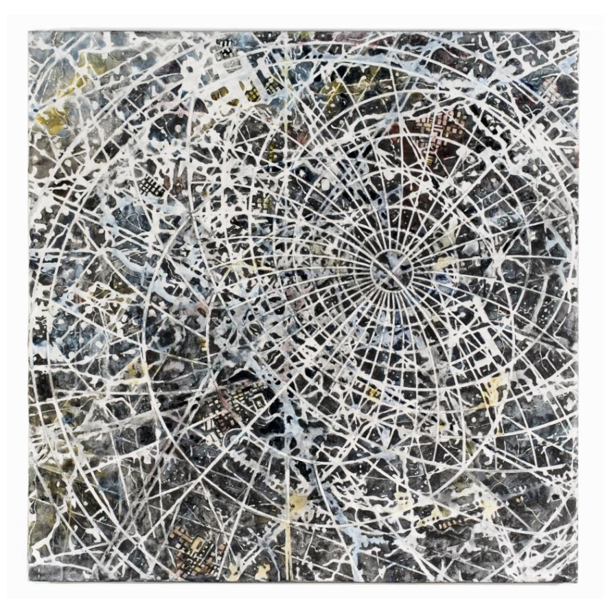
"Interference" (2016) in mixed media on linen by Cheryl Goldsleger

The work seems to be about how we order and make sense of the world: Those organizing lines in grids and circles overlaid over the landscapes suggest our desire for control.